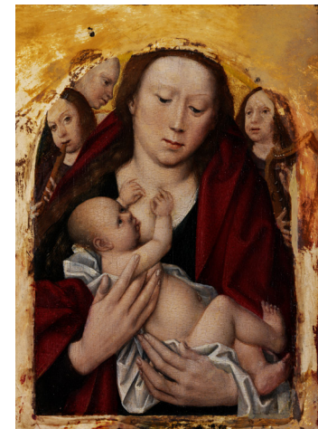
Virgin and Child, oil painting, Robert Campin, 15th century. Museum No. 769:1-1865.