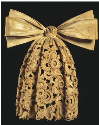
Carving, Grinling Gibbons, about 1690. Museum no. W.181:1-1928.