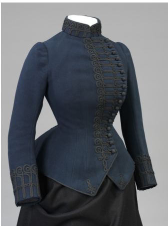
Riding habit jacket, John Redfern & Sons, 1885-1886. Museum no. T.430-1990.