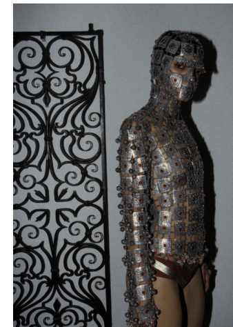
Fashion in Motion: Alexander McQueen and Shaun Leane, October 2001.