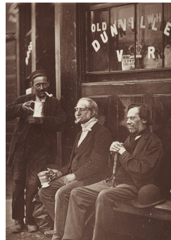
The "Wall Worker", photograph, John Thomson, 1877 - 78. Museum no. PH.332-1982.