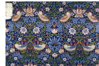
Strawberry Thief, furnishing fabric, William Morris, 1883. Museum no. T.586-1919.