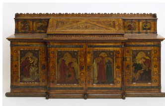
King René's Honeymoon Cabinet, 1861. Museum no. W.10:1 to 28-1927.