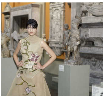
Fashion in Motion: Alexander McQueen, 1999.