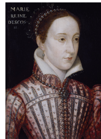
Portrait of Mary Stuart, Queen of Scots, Francois Clouet, 17th century. Museum no. 625-1882.