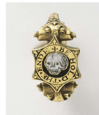
Ring, unknown maker, 1550 – 1600. Museum no. 13-1888.