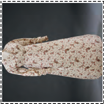
Gown, block-printed cotton Artist/maker unknown, about 1810 Place of origin: England