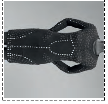
Dress, nylon and elastane Designed by Christopher Kane for Topshop, 2009 Place of origin: India