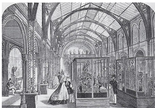
'The Loan Collection of Works of Art at South Kensington Museum', The Illustrated London News (6 December 1862), V&A Archive, MA/32/544, negative GD 2967

Organised by J. C. Robinson, the Special Exhibition of Works of Art on loan of the Medieval, Renaissance, and more recent epochs of 1862 was intended to counterbalance the displays of contemporary manufactures at the London International Exhibition. Between 9,000 and 10,000 Medieval and Renaissance objects on loan from 553 persons were exhibited. The exhibition attracted almost 900,000 visitors. Many of the objects included in this display remained on loan for the greater part of 1863 and it was suggested in press coverage that some of the loans should be acquired for the national collection. The Illustrated London News profiled the loan collections in its 21 June 1862 and 17 January 1863 issues.