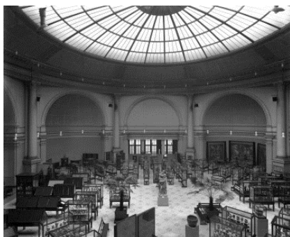
The Octagon (Loan) Court, 1920, V&A Archive, MA/32/410, negative 49410

By 1924, the growth of the Museum's collections was such that the merits of reserving an area as large as the Octagon Court for temporary loans was questioned (archive ref. MA/47/1/1). It was not until 1933, however, that the 'Moot of Senior Officers' decided to assign the space to the Furniture Department and loans were no longer displayed together but absorbed within the appropriate departmental permanent exhibits (MA/47/1/2); this decision was subsequently presented to the Advisory Council for further consideration at its 25 January 1934 meeting (MA/49/1/3).