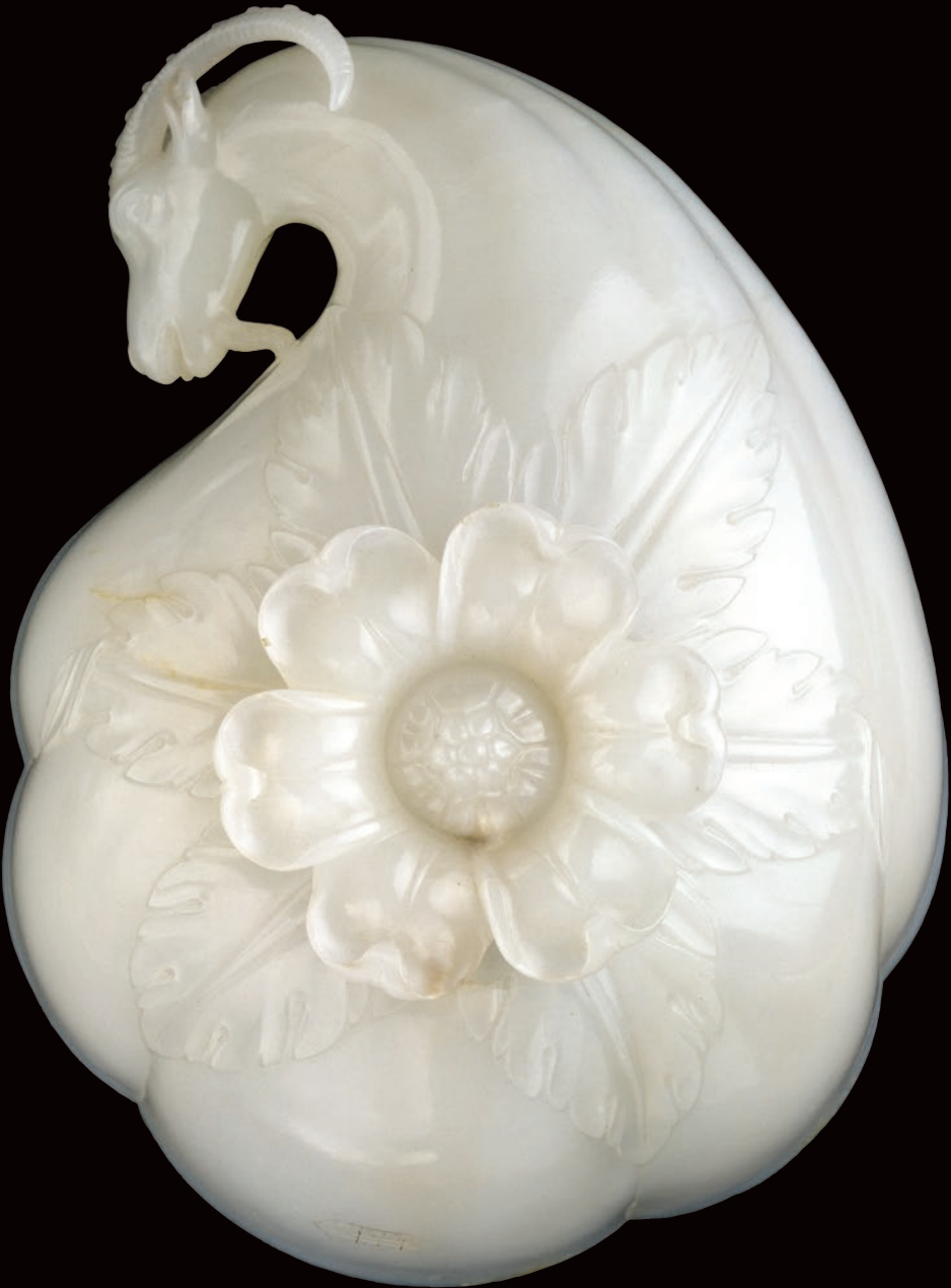
Wine cup of Shah Jahan India, 1657

Discover incredible patterns from around the world, including the Islamic Middle East and South Asia.