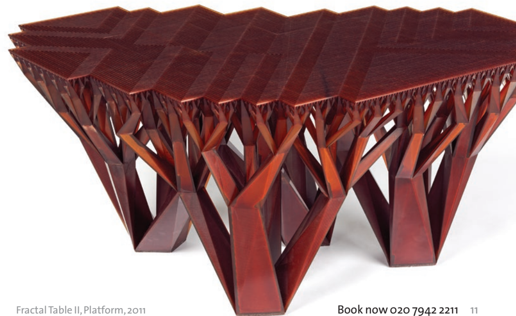
Fractal Table II, Platform, 2011

Free, places limited to 20 schools with a maximum of 2 teachers and 25 students per school, booking essential