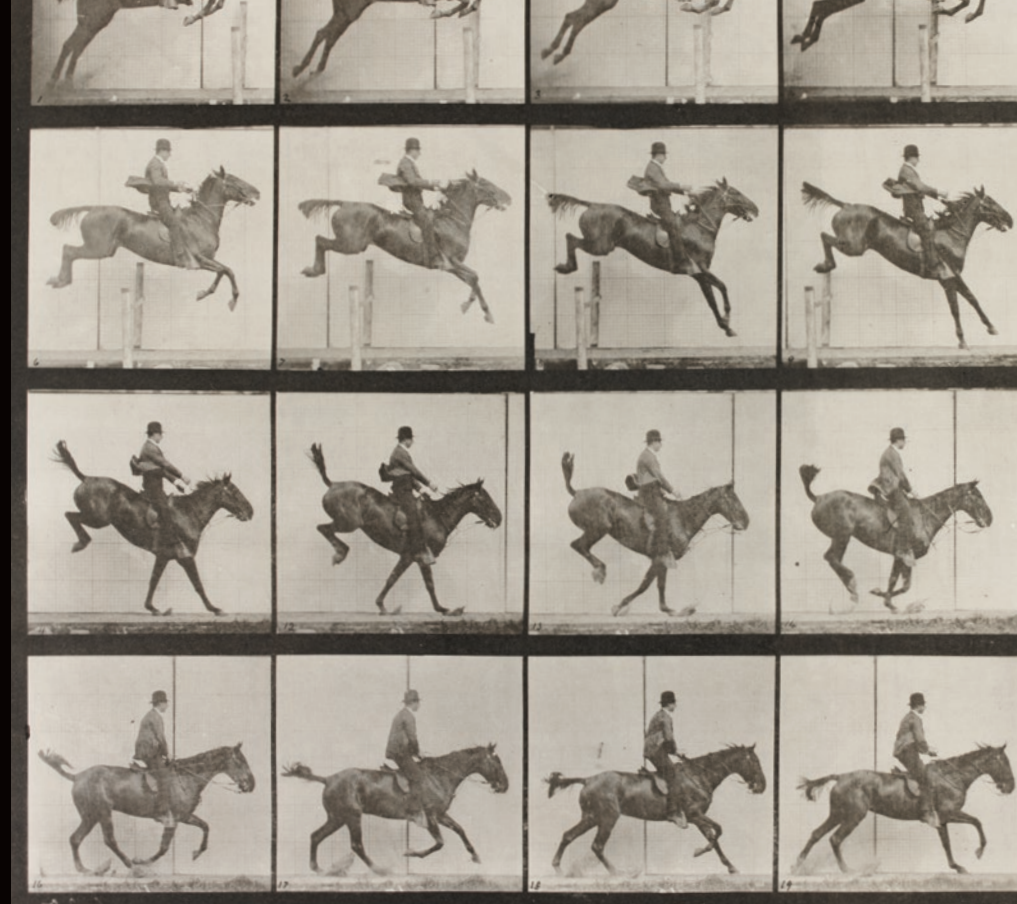
Horse jumping a fence with rider Eadweard Muybridge, 1887