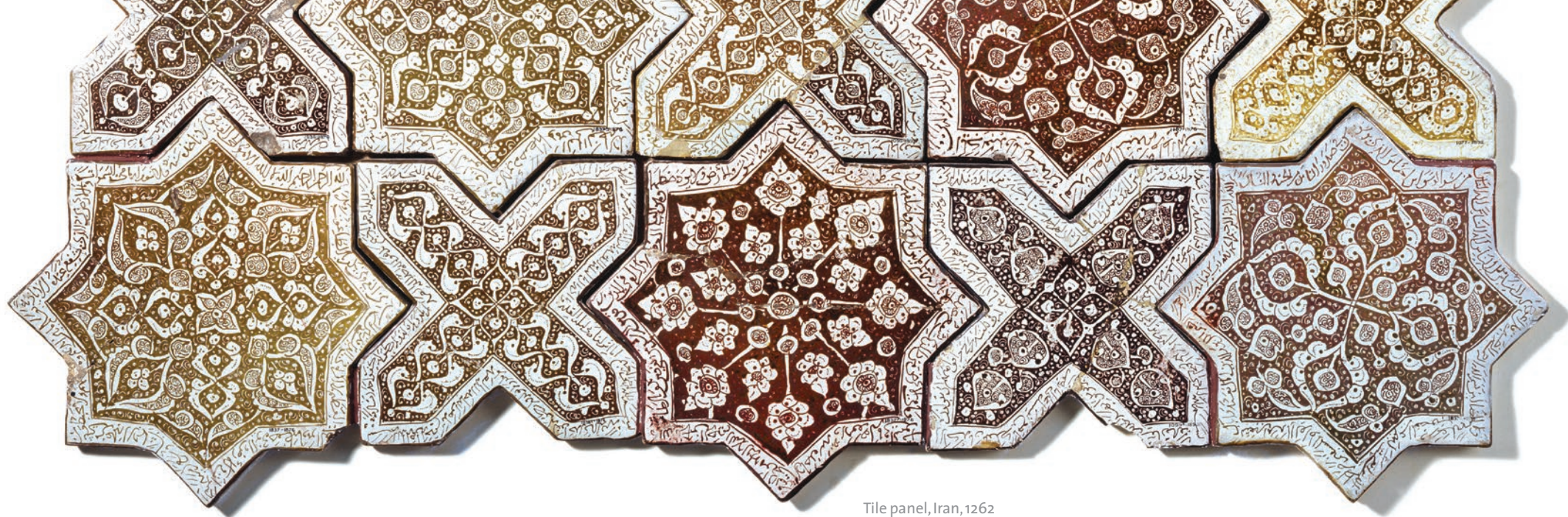
Tile panel, Iran, 1262