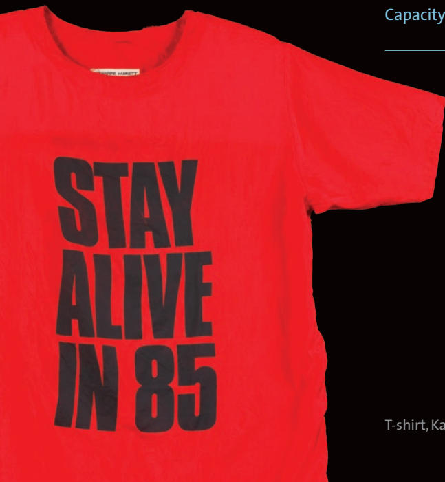
T-shirt, Katharine Hamnett, 1984