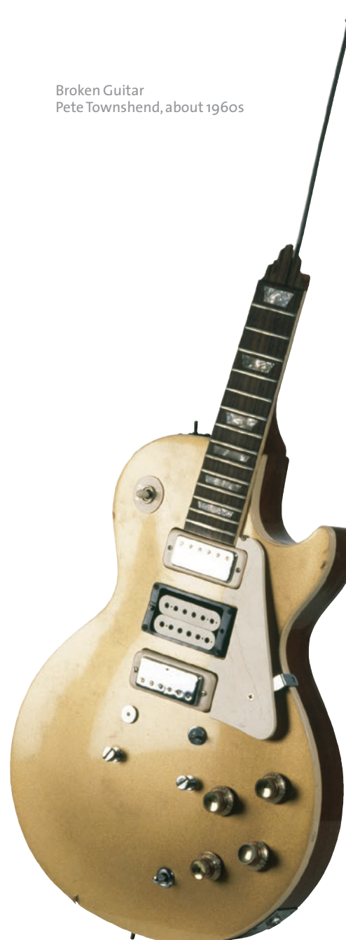
Broken Guitar Pete Townshend, about 1960s