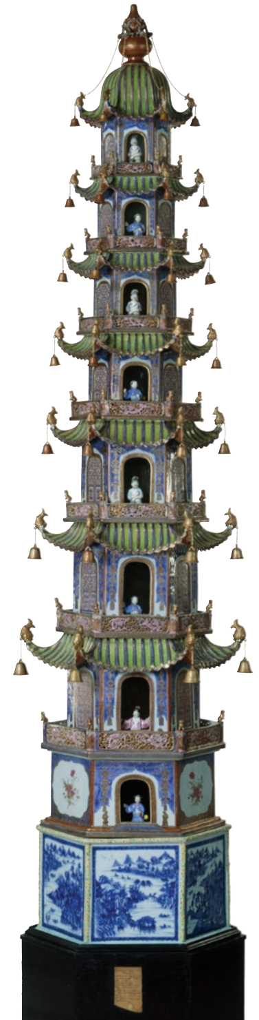
Model of a Chinese Pagoda China, about 1800

For further information on getting here, including coach drop-off points, visit www.exhibitionroad.com/where