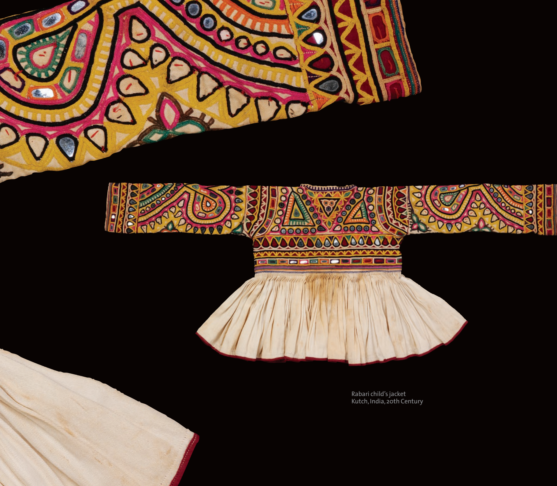
Rabari child's jacket Kutch, India, 20th Century