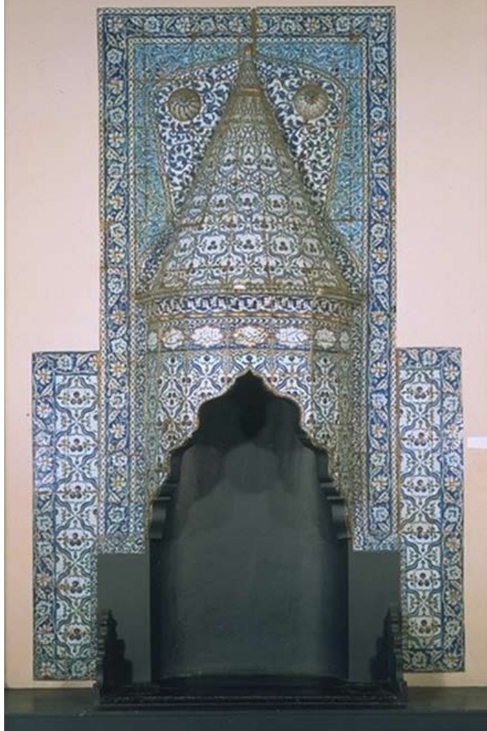
Tilework Chimneypiece, 1731. Museum no. 703-1891