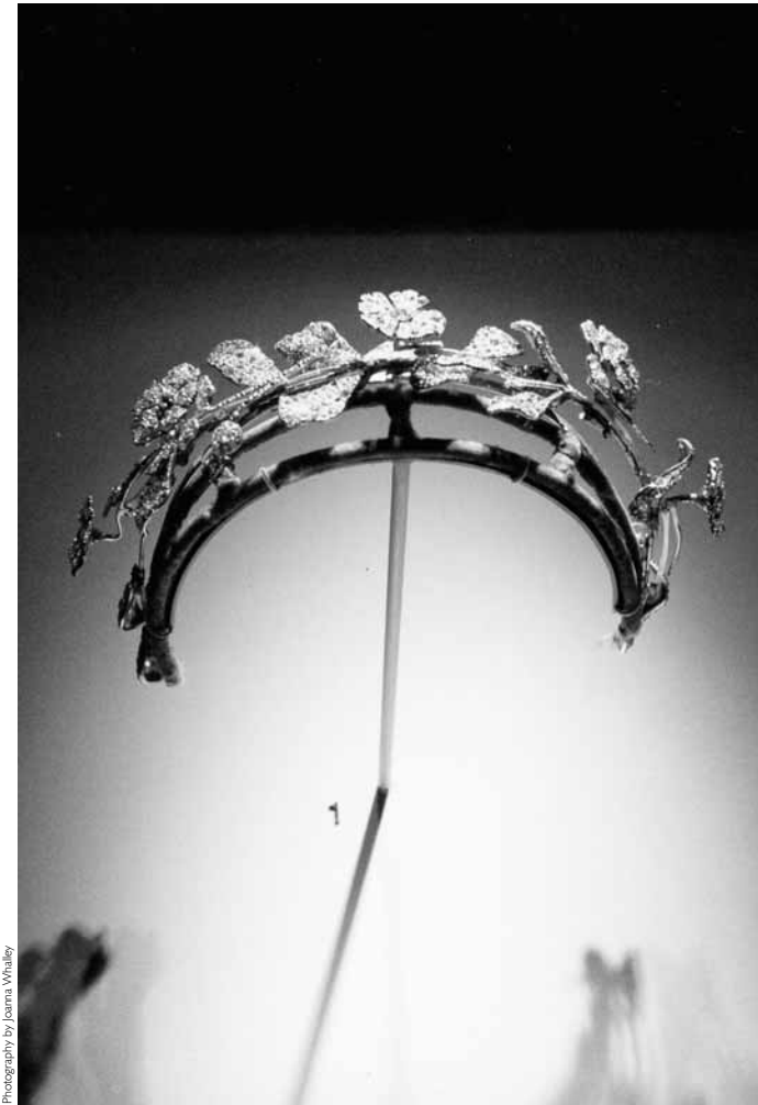
Figure 2: The tiara installed