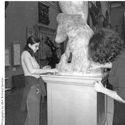
Fig 1 Sculpture conservator preparing an object for moving.