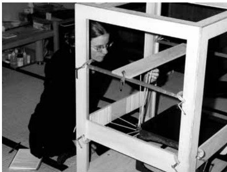
Figure 2. Using flexible sticks ( shimbari ) to apply gentle pressure to consolidated flakes of lacquer