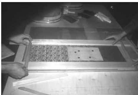
Figure 1. Squaring up silk mount on a newly mounted Japanese scroll