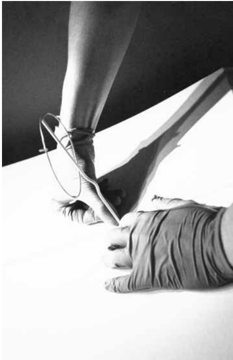
Figure 1: Inserting the mount into the backboard

The V&A's designer for the show, Catherine Byrne, wanted the tiaras to appear to 'float in space'. With this in mind, three companies were invited to provide samples of mounts in both acrylic and brass. Materials specifications were provided by Conservation.