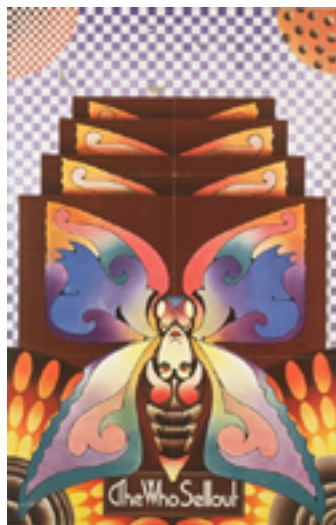
The Who Sell Out poster, Adrian George, 1960s.

These rooms provide free access to the outstanding collections of drawings, sketchbooks and archives of the British Architectural Library, the Royal Institute of British Architects, and the administrative archive of the RIBA. The collection is available by appointment only, from Tuesday to Saturday, 10.00–17.00; for further details or to make an appointment please email drawings&archives@vam.ac.uk or call 020 7307 3078.