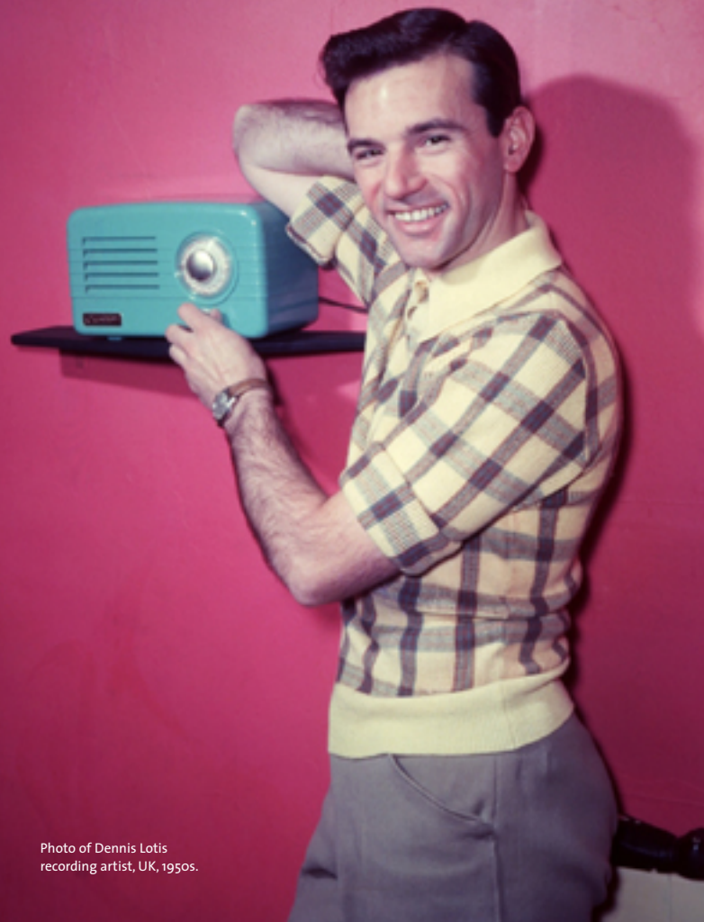
Photo of Dennis Lotis recording artist, UK, 1950s.