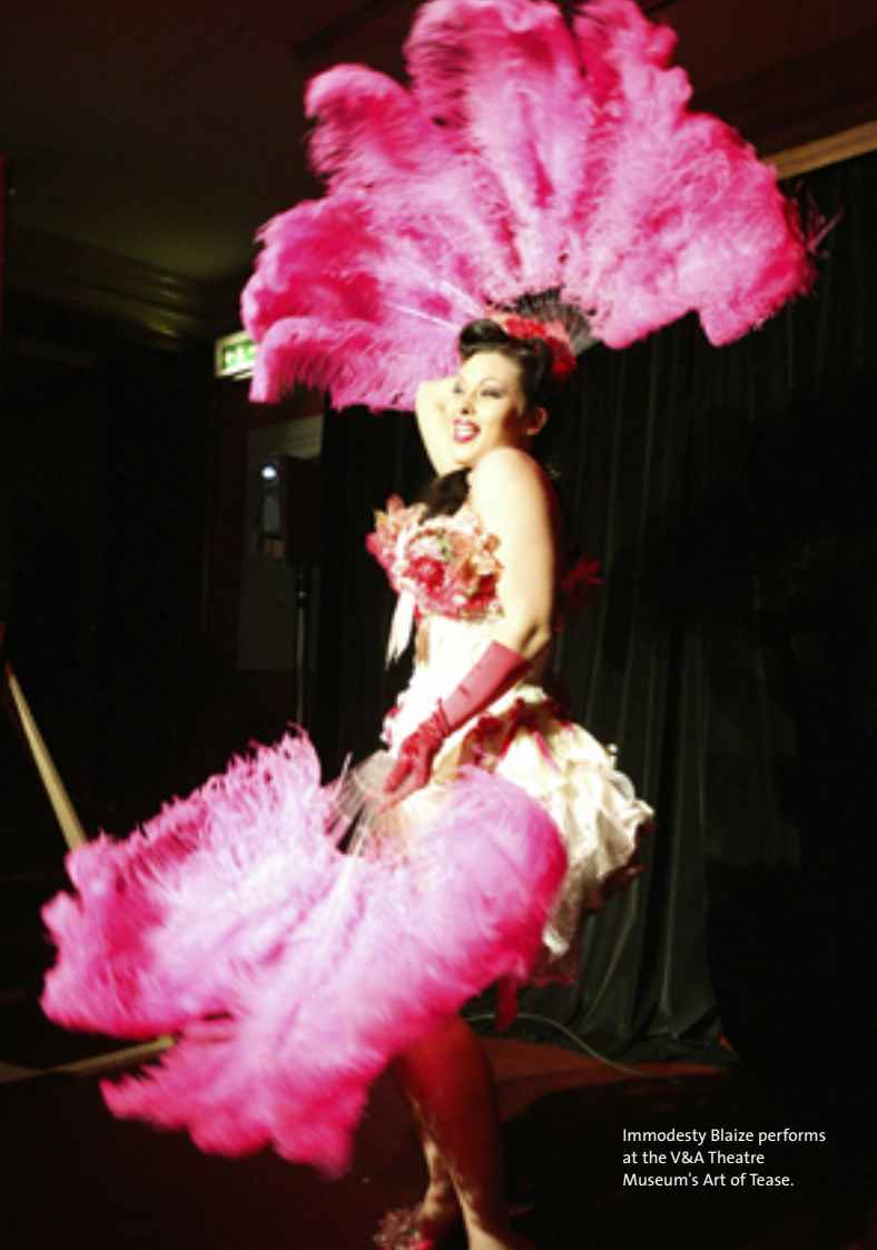
Immodesty Blaize performs at the V&A Theatre Museum's Art of Tease.