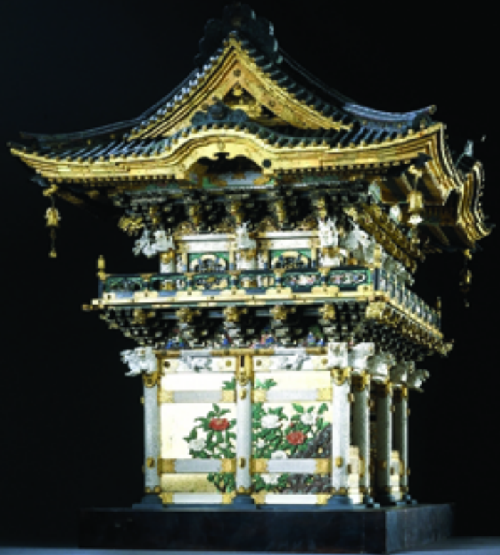
The Tomb of Shogun Ieyasu Tokugawa at Nikko, Japan, 1875–1900