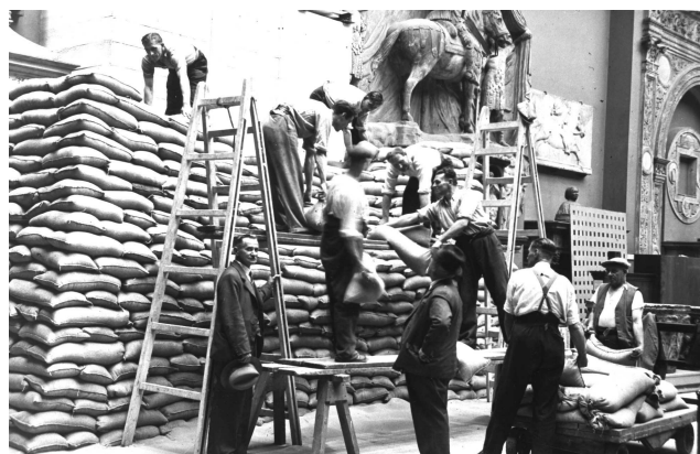
Photograph of workmen sandbagging immovable objects during the Wartime dismantling of the V&A, 1939-45.

The onset of both World Wars forced a range of changes upon the Victoria and Albert Museum and its collections. Plans were put in place to protect the collections from the possibility of damage by enemy action during World War 1 and military recruitment had a major impact on staffing.