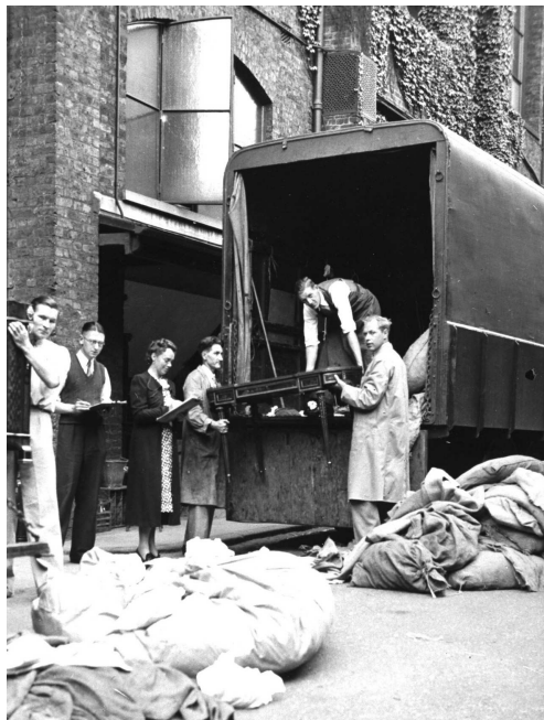
Photograph of men loading a van during the wartime dismantling of the V&A, 1939-1945

The ED84 series of files charts the administration and opening of the V&A and the Bethnal Green Museum during the wars, air raid precautions and damage, and correspondence about the protection of the objects. They also contain correspondence with provincial museums offering advice during World War 1. Significant records include air raid precautions to the V&A, 1936-1944 (ED 84/264 to ED 84/270) and to Bethnal Green, 1944-1954 (ED 84/305 to ED 84/310). The Archive also contains a Report on Museums during World War 2 (accession reference A0158), Library air raid precautions (A0003 and A0359) and Museum reorganisation and reconstruction papers, 1944 (MA/46/4/12).