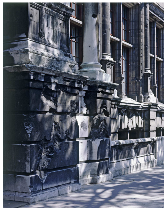
Photograph of the Aston Webb facade of the V&A Museum. Exhibition Road. Bomb damage during World War 2.

The Museum has collected general press cuttings from 1837 onwards (MA/49). These provide an insight into the V&A's position during wartime and are a valuable source of information on the progress of the war and the damage done worldwide.