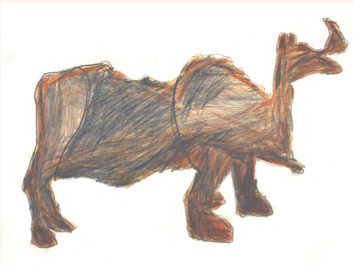
RHINOCEROS , AD 25–220, Eastern Han dynasty (Burial) 'What do you think the brown skin of the rhinoceros would feel like if you touched it?'

All images are by Christian Ovonlen and are ink and colour pencil on paper, 2014.