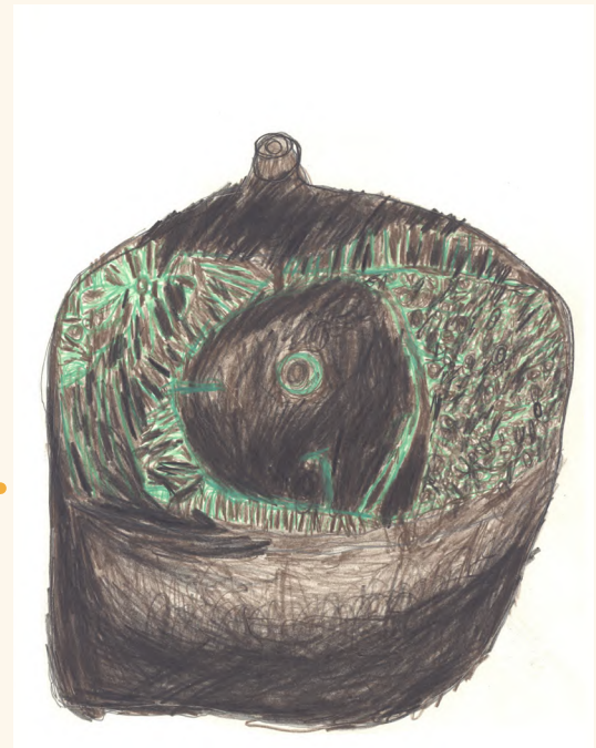
JAR WITH FISH DESIGN, 1279 – 1368, Yuan dynasty (Collecting)

'The jade vase is light grey-green and is very big.'