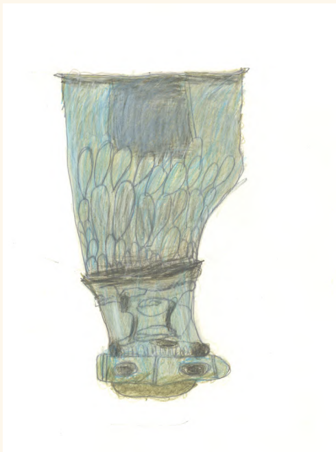
VASE WITH DRAGON PEDESTAL

'I like the book, and the red, yellow and orange flowers with the light pink and lots of green leaves, and burgundy red.'