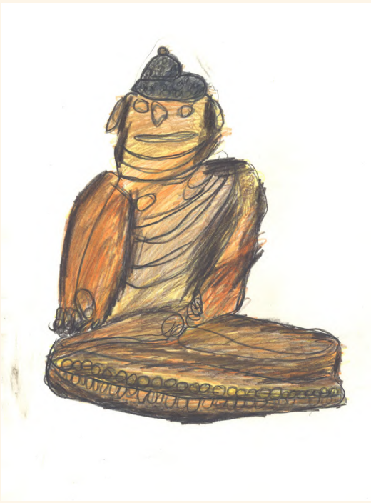
BUDDHA , 1500–1600, Ming dynasty (Temple & Worship)

'I like the colour of the Buddha because he has a gold colour skin and hands and dress.'