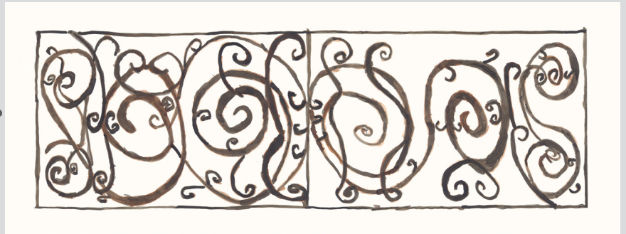
PANEL , Germany, about 1650–1700 'This panel is about 300 years older than the grille. The patterns in this panel look like a shell, and are more formal than the grille.'